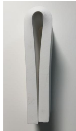
033T Flexy White

SEE THE THERMOFORMING TESTING MOLD, WHICH IS MADE WITH MDF OR PLYWOOD.