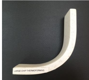
Large Chip Color